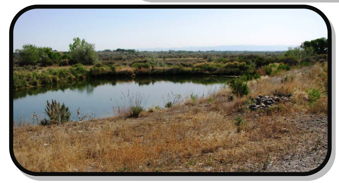
Fire Suppression Pond